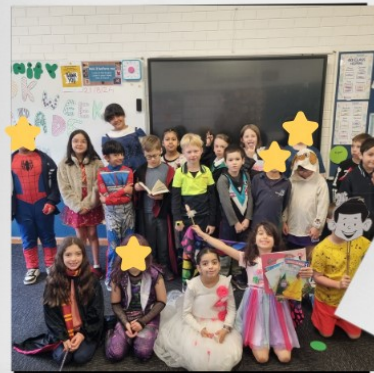
LOOK AT ALL THOSE AWESOME CHARACTERS!

We made some Silhouette Artwork based on the Aboriginal Dreaming story 'The Mimi's'.