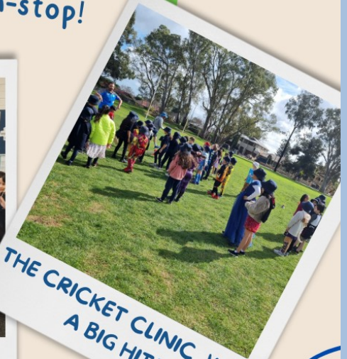
THE CRICKET CLINIC WAS A BIG HIT!